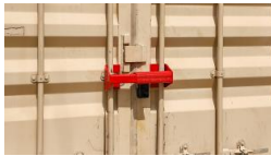
THE EQUIPMENT LOCK COMPANY